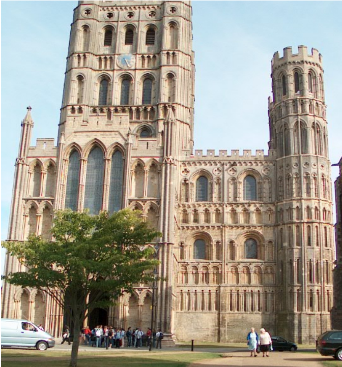
Ely Cathedral: The 700-year-old walls in Ely Cathedral, England, are festooned with dedications like those featured below.

have been steeped in traditional, mystical, ritual, or material religions seek this recognition. They thus have built huge, ornate, and impressive: