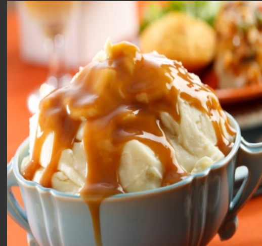
Mashed Potatoes and Gravy